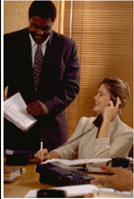
Coaching actually takes place back at work between workshops.

As can be seen from the flowchart below, this qualification offers a platform that has academic rigour and practical experience that enables the participant to become competent in the art of coaching.